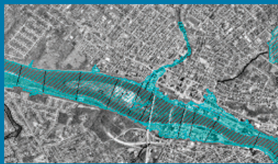
Digital Flood Hazard Data